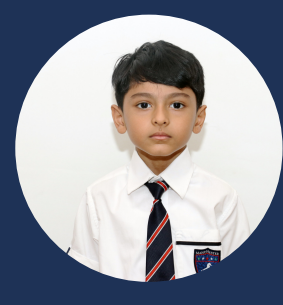
Prahalad V PYP1